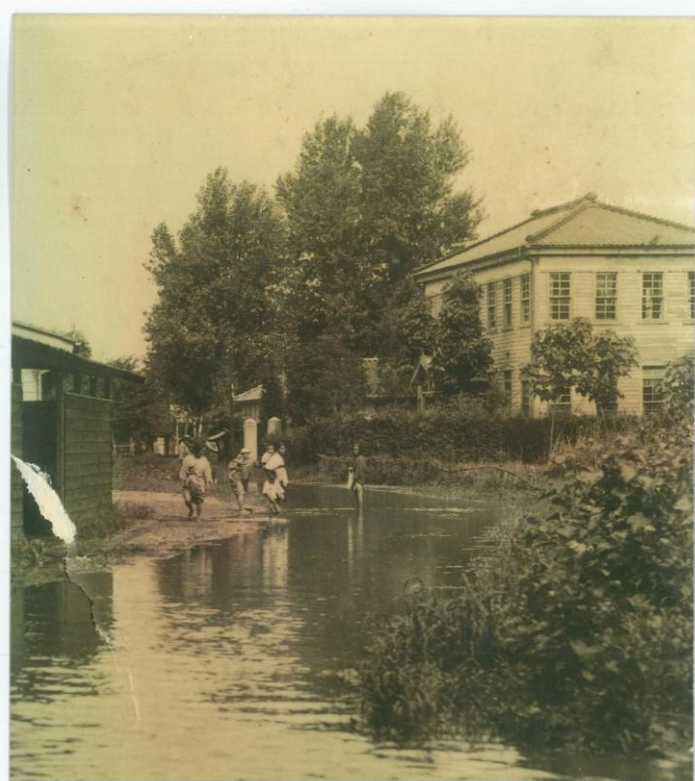
Takashimamura village office (after Typhoon Katherine in 1947).