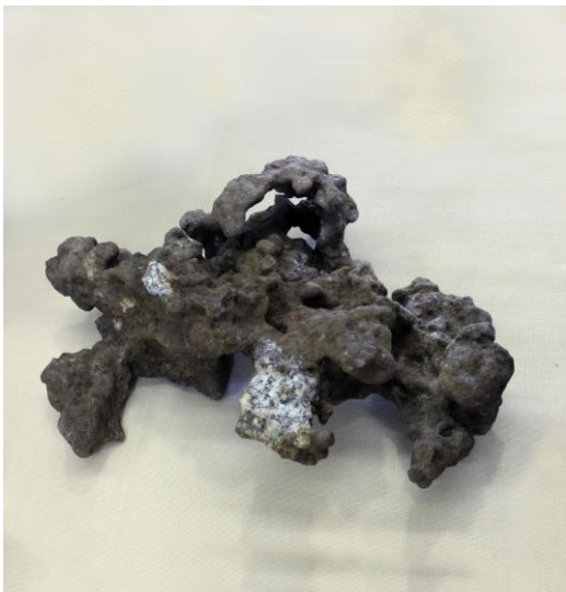
Melted duralumin from the Slick's Chick's.