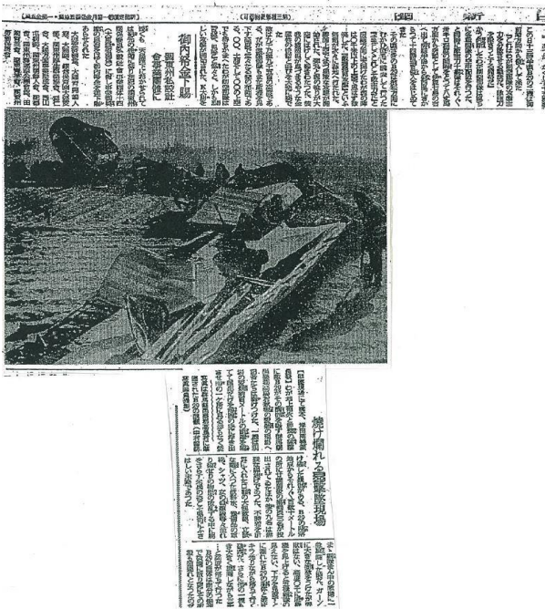
Mainichi Newspaper, 12 February 1945